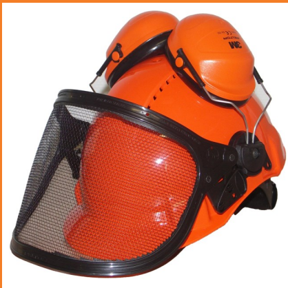
Safety helmet complete