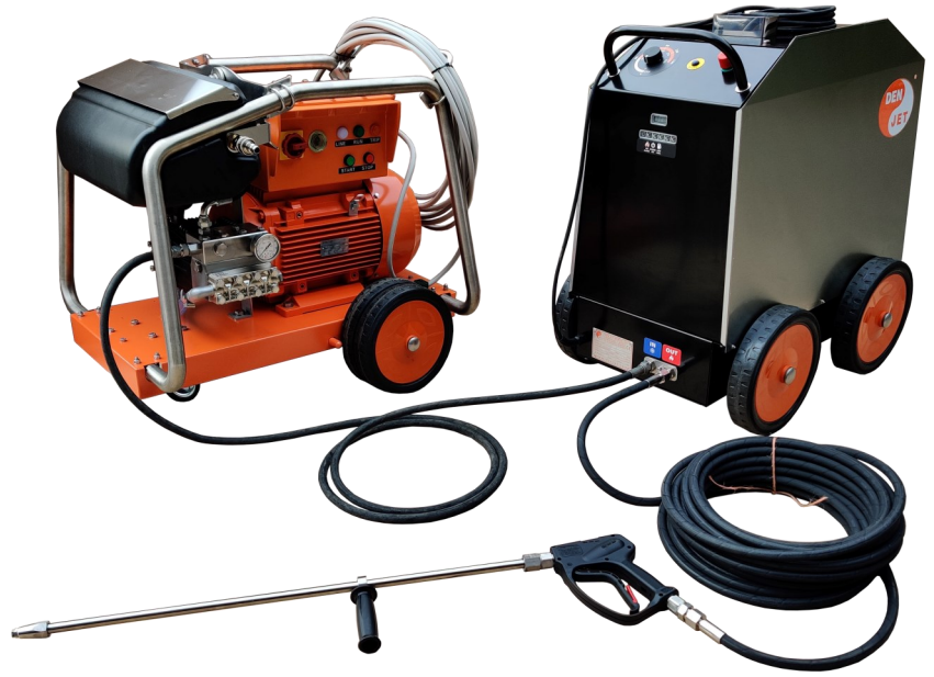
HOT BOX with CE20-500 and dry shut gun 500bar