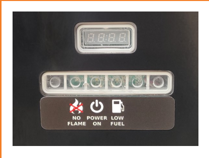
LED display and working hours