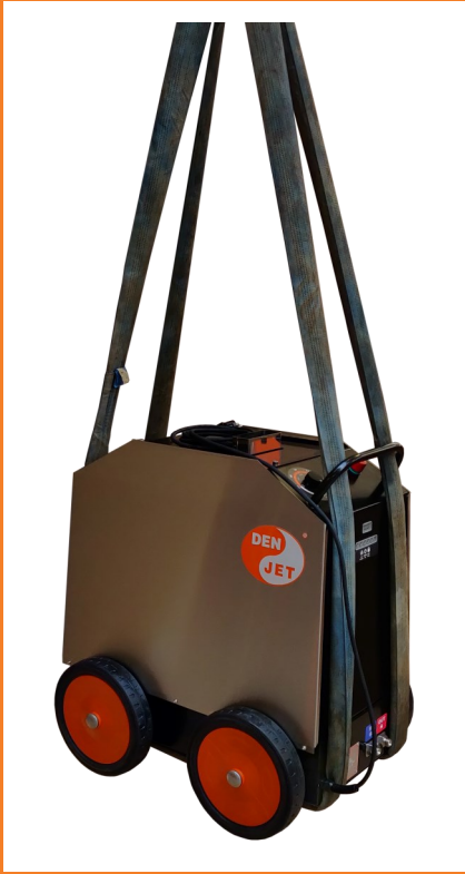
Lifting hot box