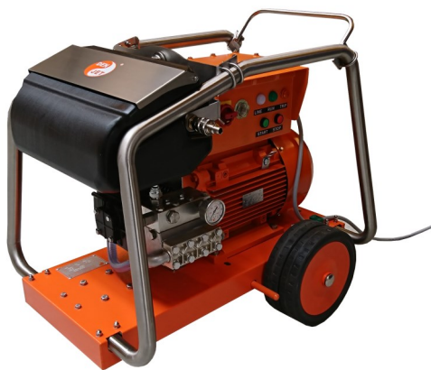
CE 20 Series