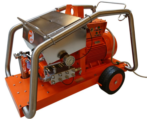
CE 40 Series