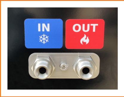
Inlet and Outlet 1/2" BSPP